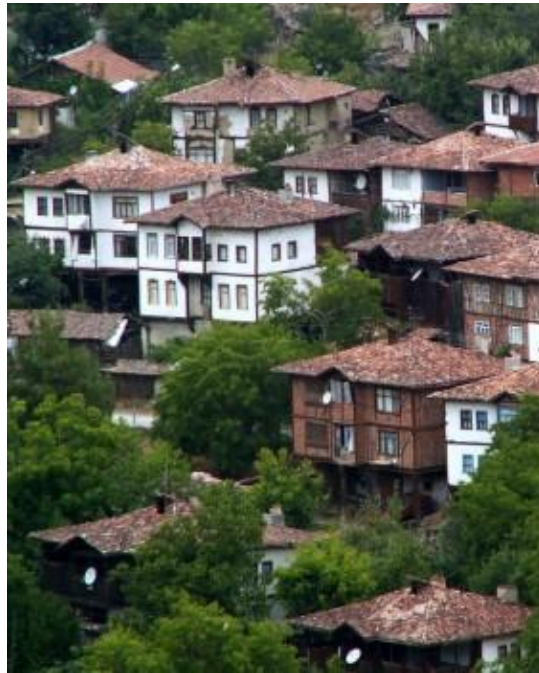
Historical Houses in Boyabat

TO EDUCATE TRAINEES IN THE LIGHT OF THEIR WILLINGNESS, INTERESTS AND TALENTS TO LET THEM ACCOMPLISHED ECONOMICALLY, SOCIALLY AND CULTURAL.